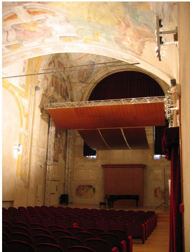
Casa Paganini – InfoMus, Auditorium